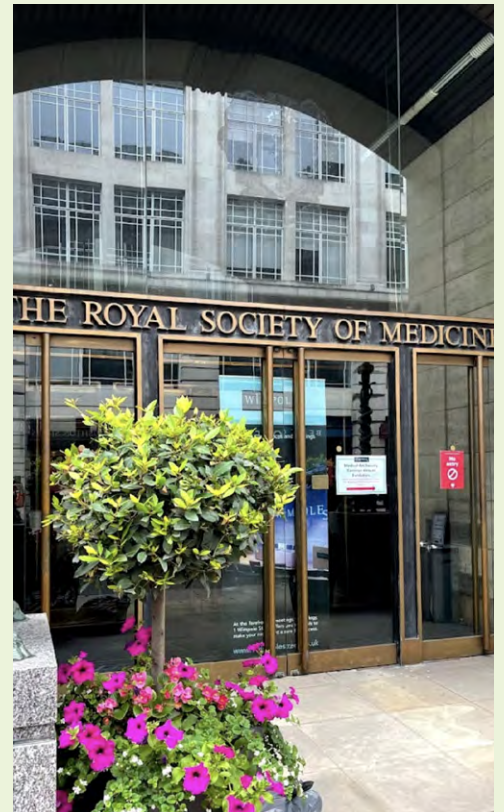
Photo: 1 Wimpole Street

Royal Society of Medicine , 1 Wimpole St, London W1G 0AE